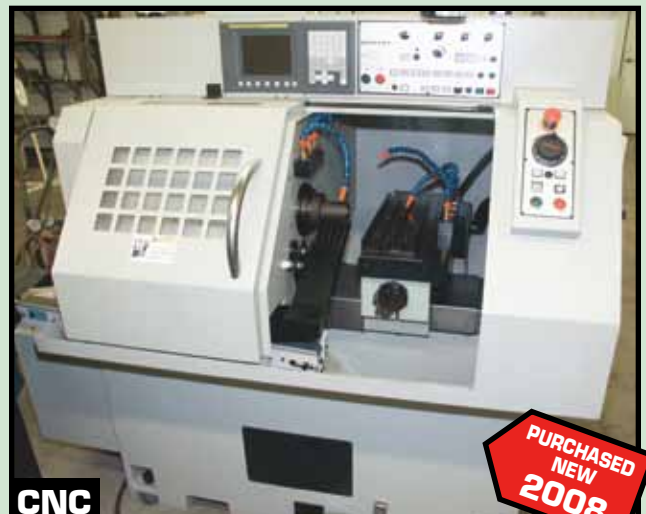
HARDINGE TALENT 6/45 CNC CHUCKER