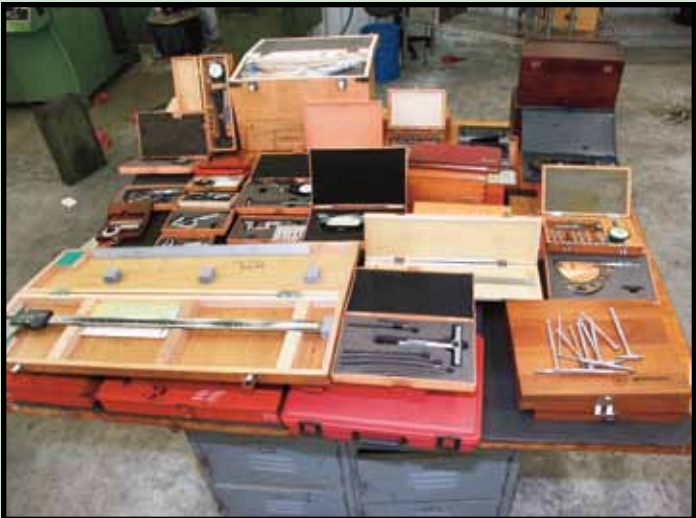
VIEW OF Q.C. AND PRECISION MEASURING EQUIPMENT