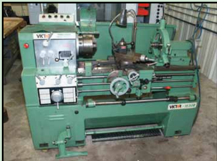
VICTOR 16" X 30" ENGINE LATHE

HYBCO MDL. 2100SB , motorized, swiveling base, (6) assorted form relief cams, tailstock attach., S/N RF-1011.