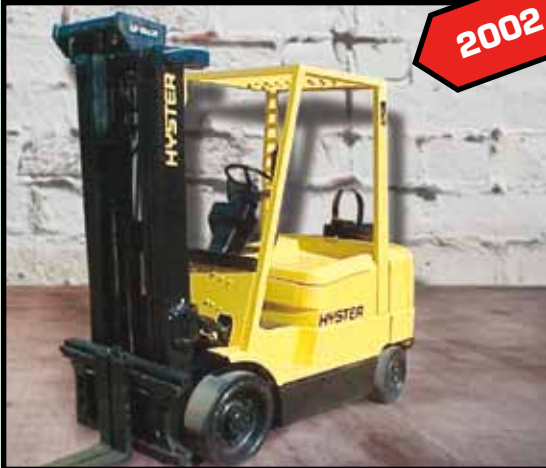
HYSTER 5,000 LB. CAP. FORKLIFT