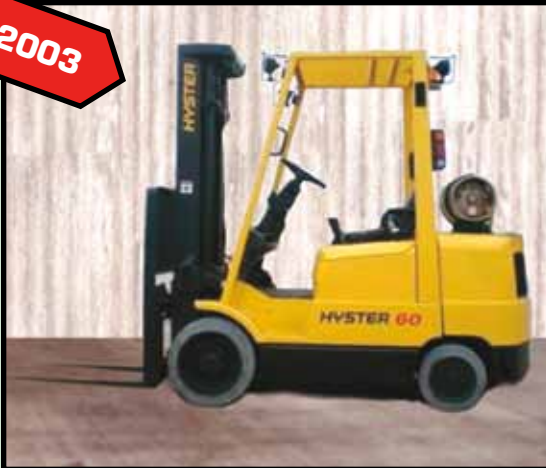
HYSTER 6,000 LB. CAP. FORKLIFT