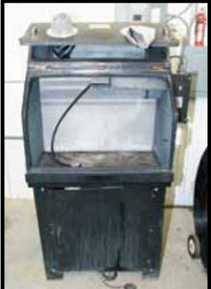
HIGH PRESSURE AQUEOUS PARTS WASHER