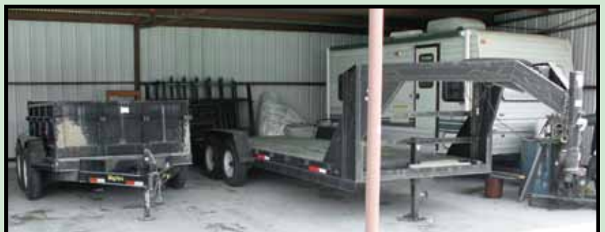
PJ TRAILERS GOOSENECK FLATBED TRAILER