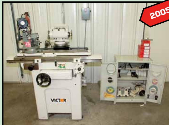
VICTOR TM40 TOOL & CUTTER GRINDER