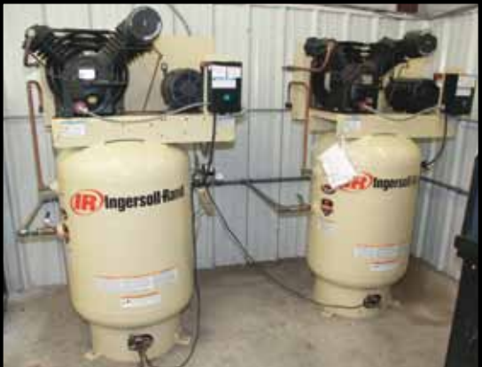
INGERSOLL-RAND 10 HP 2-STAGE AIR COMPRESSORS