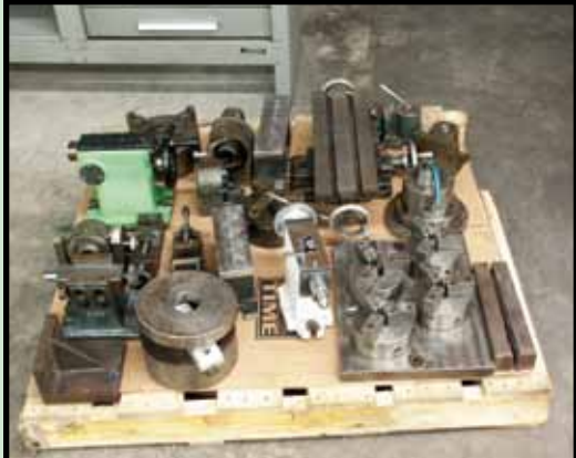
SAMPLE VIEW OF PRECISION MACHINE ACCESSORIES

MISC. ALUMINUM ROUND AND SQUARE TUBING, MISC. MILD STEEL AND ALLOY BARSTOCK, HEX BAR TUBING, STRUCTURAL SHAPES AND MISC. PVC TUBING, (27 PCS.) 17-4 STAINLESS STEEL BARSTOCK, 1-3/4" dia., assorted lengths from 9' to 11', ASSORTED ALLOY IN SIZE STAINLESS STEEL AND ALUMINUM BARSTOCK, STEEL ALLOY BARSTOCK; STAINLESS STEEL ALLOY 303 2" O.D. X 12'L. BARSTOCK-PLEASE INSPECT AT AUCTION SITE.