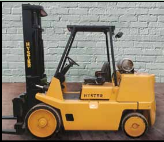
HYSTER 13,500 LB. CAP. FORKLIFT

INSPECTION: Wednesday, September 16, 9:00 A.M. to 4:00 P.M. & Morning of Sale