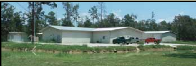
REAL ESTATE FOR SALE SUBJECT TO CONFIRMATION OF HIGH BID!

Assets No Longer Needed in the Operations of K-D MACHINE 11200 FM 1485 Rd., CONROE, TEXAS 77306 (See Directions on Back Page)